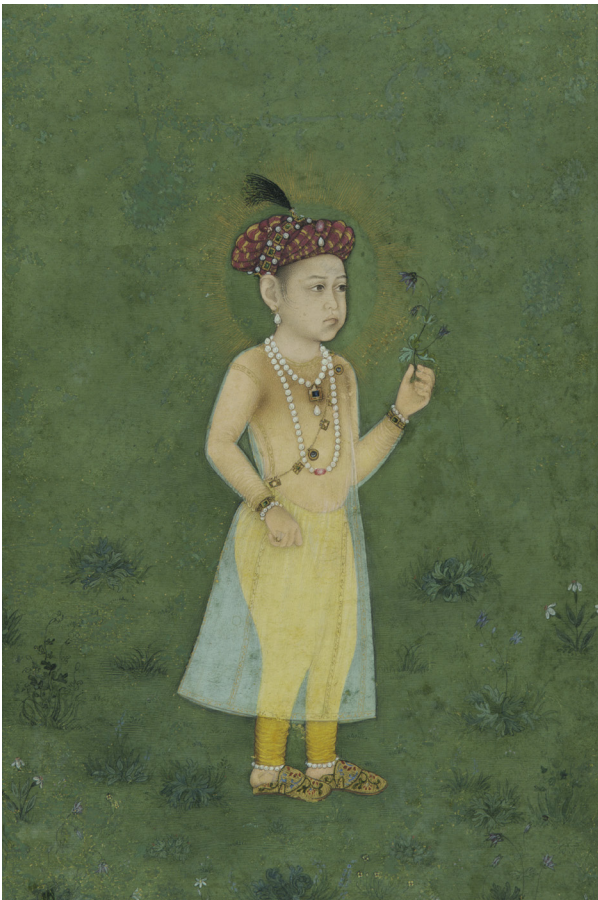
Shah Shuja' (Smithsonian Institution)