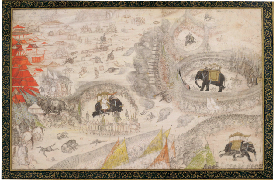
Battle of Samugarh (Harvard Art Museums)

It seems he was exhausted and longed to be back in the imperial court. In 1646, Aurangzeb's brother Murad also deserted his command in Balkh on the northwestern frontier. But despite the drawbacks of being and feeling out of touch with events at court, princes sometimes learned that in the bitter competition for the throne, certain advantages accrued to having relative independence. Thus, for a time, Akbar's son Murad evaded his father's efforts to bring him back to court from his command in the Deccan. As tensions with his father and stepmother, Emperor Jahangir and Nur Jahan, increased in the early 1620s, Prince Khurram in fact requested assignment to the Deccan. In 1645, after realizing how unwelcome he was at the imperial court, Aurangzeb begged his father's chief minister Sa'dullah Khan to assign him anywhere so long as it was far removed from the court.