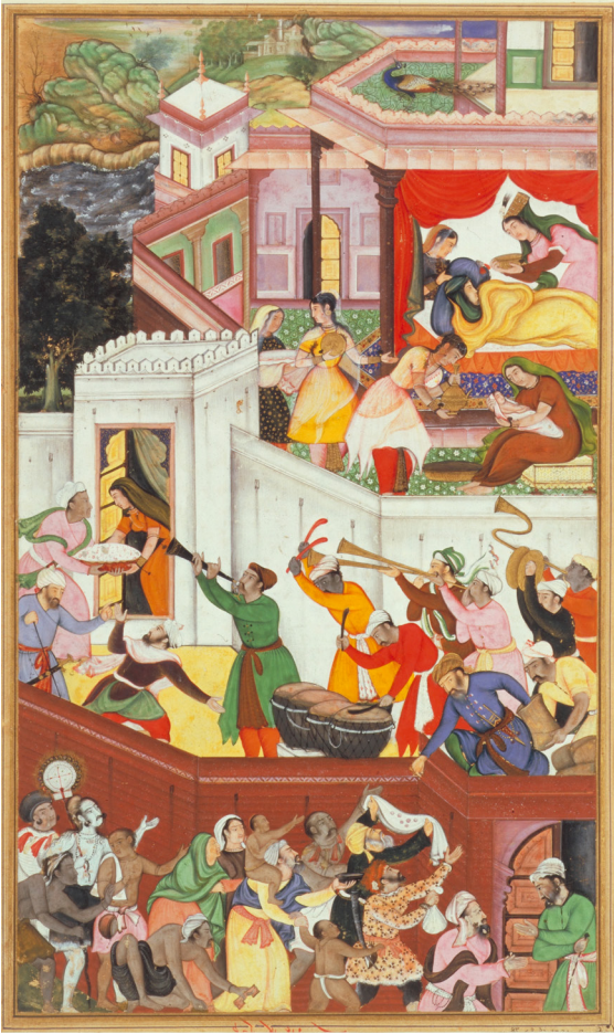
Birth of Prince Salim (V&A Museum)

After the 1580s in particular, and Emperor Akbar's decision to discontinue granting royal heirs semi-independent territories (also known as appanages), princes scrambled to establish loyal followings, accrue wealth and influence, and build their political power and military strength across an expanding imperial terrain. The stakes were high; all knew that only one prince could ascend the throne and that the rest would die. Crucially, in the course of fortifying their own power in anticipation of a succession struggle, Mughal princes helped imprint and extend dynastic authority. The Mughal Prince explores these processes, bringing to Mughal historiography new ways of understanding Mughal imperial success and fresh insights regarding an institution, the princely institution, hitherto unnamed and undescribed.