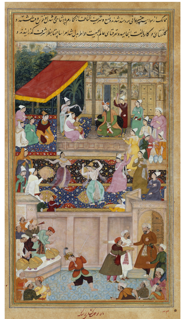
Circumcision of Akbar (British Library)

This book combines a longitudinal with a chronological organization. With the former, it identifies key themes in the story of the princely institution – the princely household; a prince's friends and allies across the empire; his disobedience and rebellion; and finally his bid for the imperial throne. With the latter, this book identifies three main periods in the history of the princely institution: the early period (1504-1556), the high period (1556-1680s), and the late period (1680s-1707). Following the introduction, the first chapter traces the shifts in Mughal succession practices in each of these periods. While two of the remaining six book chapters focus on the early and late periods respectively, between them are four chapters that examine princely households, alliance building,