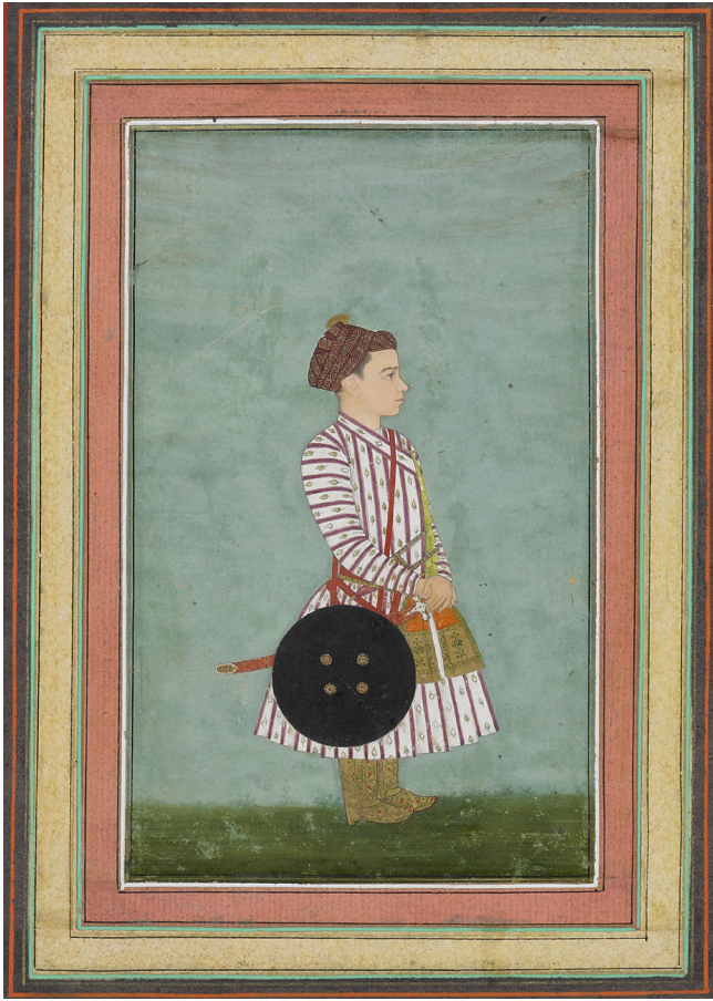
Young Prince (Smithsonian Institution)