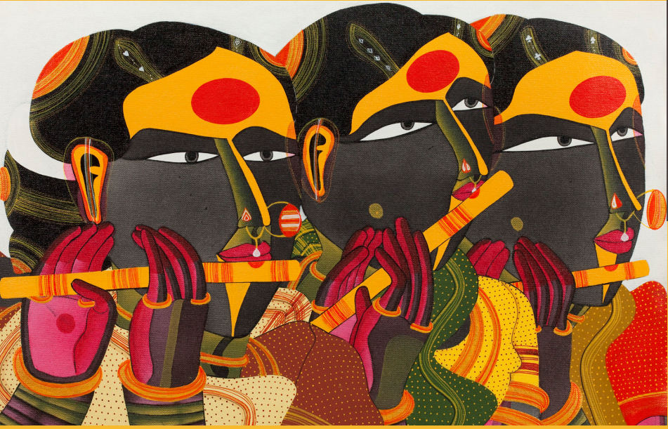
Artwork by Thota Vaikuntam