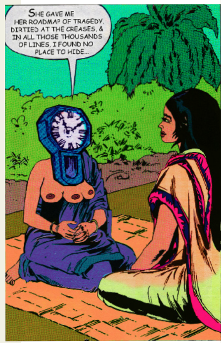
From She, The Question, Chitra Ganesh, 2008. Courtesy of the Wendi Norris Gallery

market. In 2009 Dorris started going to the art fair in Dubai, praising it for its healthy mix of super contemporary but also regionally focused artwork and their inclusion of scholarly presentations as part of the expo. Her debut show in her Jessie Street gallery in San