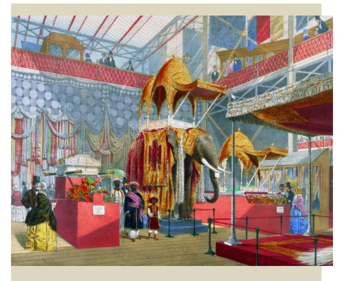
Joseph Nash, "The Indian Court at the Great Exhibition of 1851, Dickinson's Comprehensive Pictures of the Great Exhibition of 1851 (London, 1854), color lithograph on paper

the History of Art Department, the Berkeley Art Museum and Pacific Film Archive, and the Arts Research Center, Collecting South Asia | Archiving South Asia (February 18, 2014) was an attempt to theorize the aesthetic, political, and cultural systems of business as usual . Focusing on assemblages of capital, connoisseurship, and collecting practices, the one-day international conference brought together art historians, anthropologists, curators, and museum professionals from the United States, Europe, and the Middle East to collaboratively rethink histories of collecting and archiving from the nineteenth century to the present.