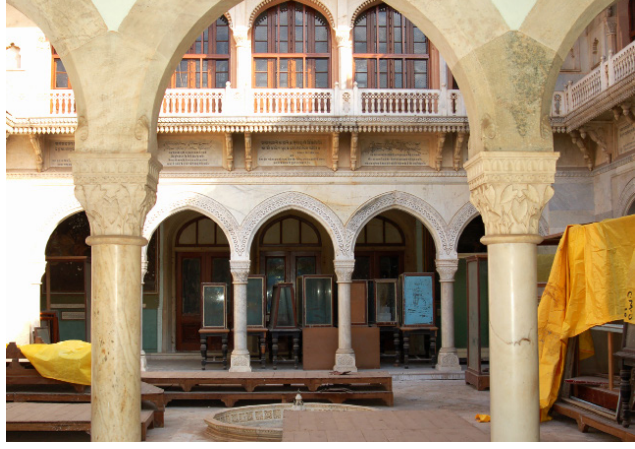
The Jaipur Economic and Industrial Museum (established 1887) under renovation.