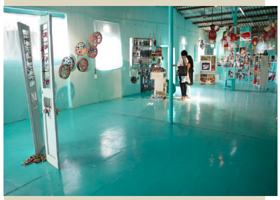
Installation View, Ghari/Ghar Pe/At Home, Shree Ganesh Vidya Mandir High School, 2012, Dharavi, Mumbai.