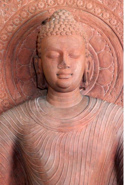
Standing Buddha from Jamalpur, Mathura (detail), Mid-5th century CE. Repository: Government Museum, Mathura.

The 19th century panel concluded with a talk by Anjali Arondekar who examined sexuality and the colonial archive in India by looking at a local legal battle over property rights and tenancy. Arondekar urged us to consider the construction of the colonial archive as a kind of ritual, full of sacred repetitions and (re)collections. She revealed how the archive can recuperate alternative histories or forgotten histories, in particular those of non-normative sexualities, and asked us to consider where the history of sexuality can be located in archives of the colonial period. Arondekar investigated the role of the archive in erasing, creating, and perpetuating certain narratives as well as the possibility of constructing a recuperative hermeneutics vis-à-vis the historiography of sexuality.