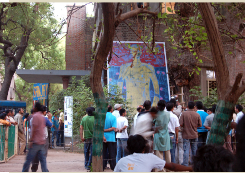
A student's examination work being removed by the Gujarat police, Faculty of Fine Arts, Maharaja Sayajirao University of Baroda, May 9, 2007.

On May 9, 2007, a final-year student at the Faculty of Fine Arts, Maharaja Sayajirao University of Baroda was arrested under sections 153A, 114, and 295 of the Indian Penal Code for promoting enmity between different groups on grounds of religion and race and committing acts prejudicial to the maintenance of harmony. Instigated by the local Hindu rightwing moral brigade, the Gujarat state police had found the student's examination work – a woodcut print of the goddess Durga – offensive and an affront to ideals of Indian (Hindu)