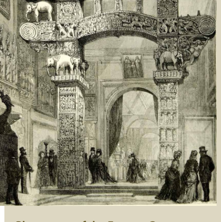
Plaster cast of the Eastern Gateway, Stupa I, Sanchi displayed in the International Exhibition, London, 1871

ter cast reproductions led to the formation of a comprehensive repository of "useful" knowledge about the colony. The narrative of the production and accumulation of knowledge became integral