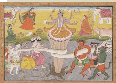
Unknown, India. The Churning of the Sea of Milk , 1700; Courtesy of the UC Berkeley Art Museum and Pacific Film Archive

In brief, their talks reflected on overarching issues pertaining to archival and curatorial practices, echoing many of the questions and concerns introduced throughout the day. Indeed, this final panel served as the ideal denouement to the con-